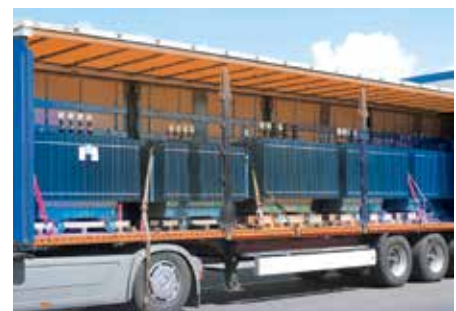
Certified transporting agencies and trucks with special bodies and load-securing equipment

Awards and certificates reflect the exacting demands we place on ourselves in terms of acting in a responsible manner.